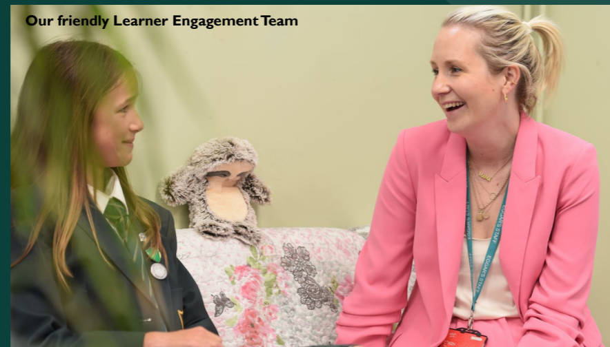
Our friendly Learner Engagement Team