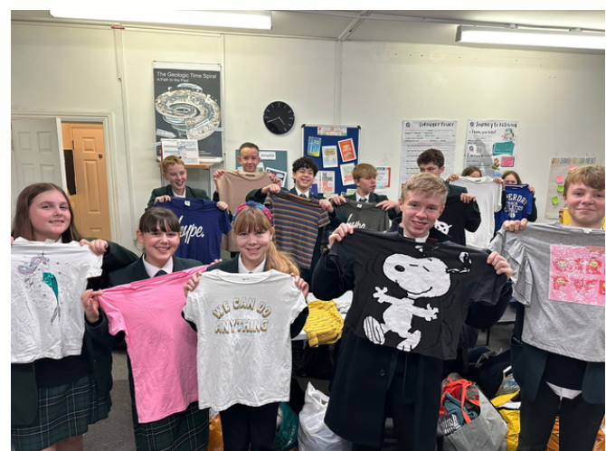
Students from Eggar's volunteer their time to sort clothes for Back on the Rack 4!